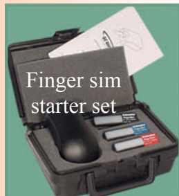
Finger sim starter set