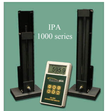
IPA 1000 series

**Important. All Warranty, Service and Calibrations are done in Australia.**